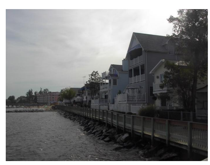
Photos 1 to 4. Few landowners choose to give up their homes to a rising sea. Top left and right: A home on pilings in front of shore protected by a stone revetment (left) and two homes protected by seawalls (right) on land extending into the Gulf of Mexico, along Bluewater Drive north of Surfside, Texas (May 2003). Bottom left: a home on pilings on an eroding beach at Kitty Hawk, North Carolina (October 2002) Bottom right: homes behind a bulkhead whose toe is protected by a stone revetment at North Beach, Maryland (September 2008).